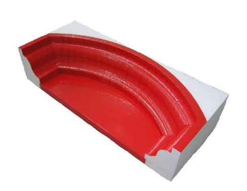
FORMWORK FOR BALCONY