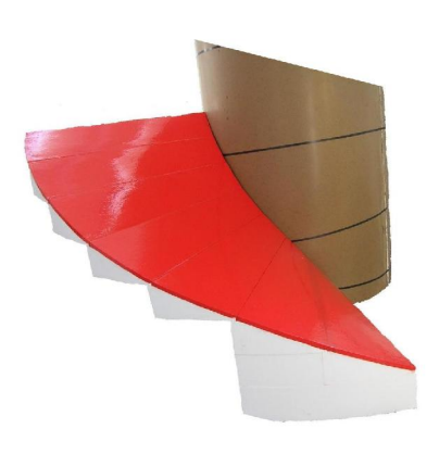
FORMWORK FOR SPYRAL STAIRCASE